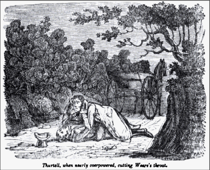
Thurtell, when nearly overpowered, cutting Weare's throat.

Thurtell decided to murder Weare by himself. He waited until he was in a secluded lane, either Loom Lane or Gills Hill Lane. He shot Weare in the face but did little damage.