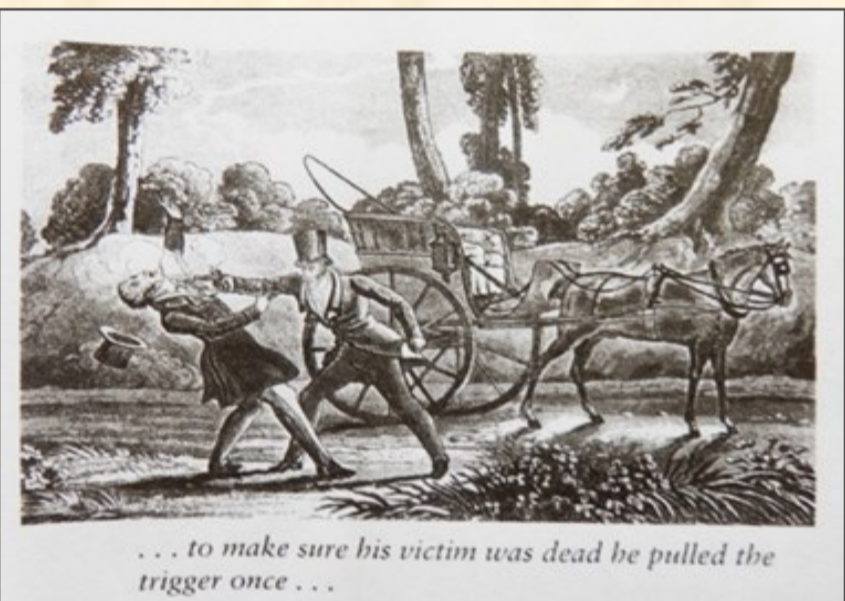
... to make sure his victim was dead he pulled the trigger once ...

Weare tried to escape but Thurtell chased him and a fight ensued. Thurtell hit Weare in the head with the butt of his gun, drew a penknife, stabbed him and cut his throat.